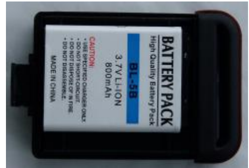
Install the battery like this.